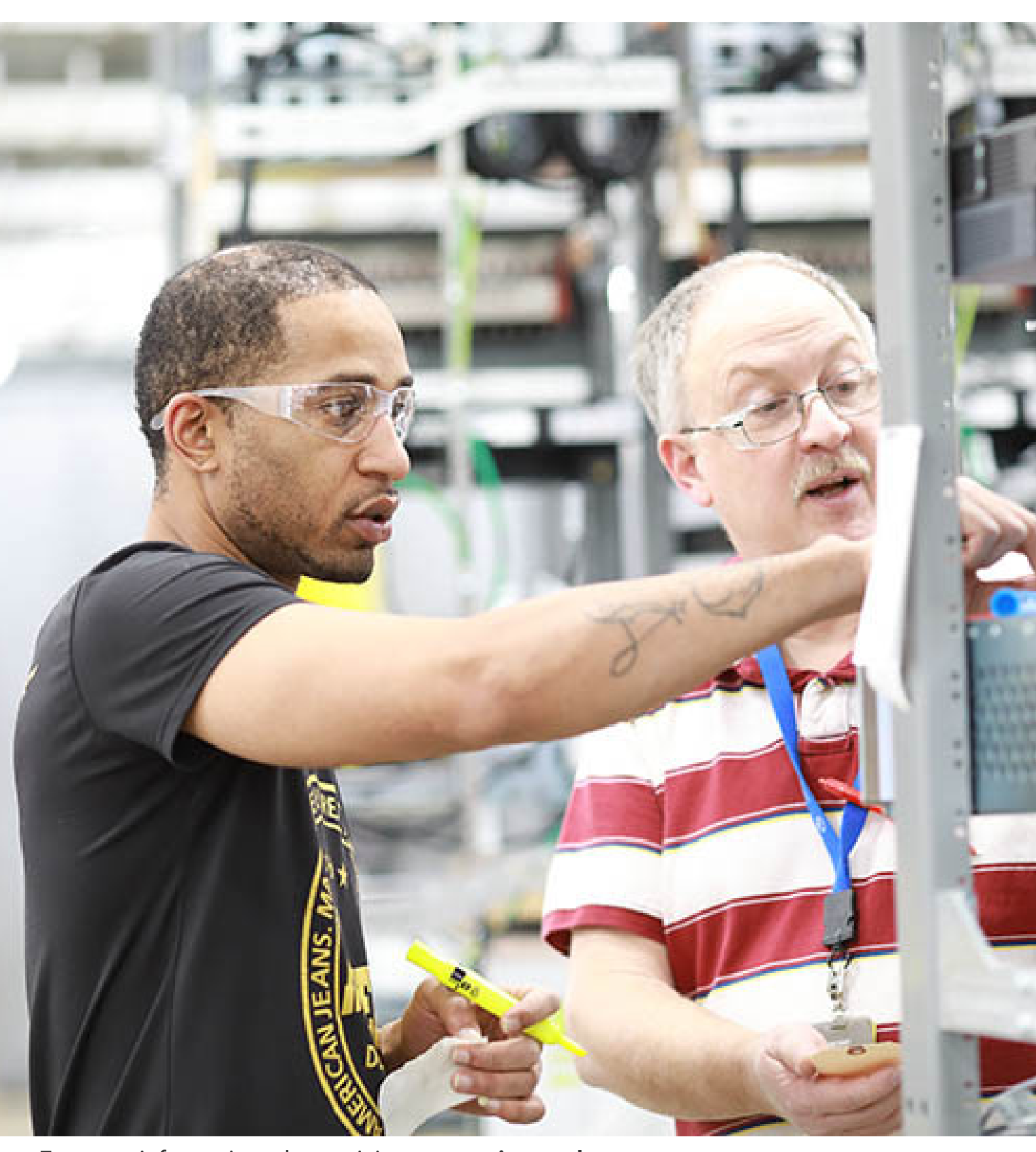
For more information, please visit {\bf www.eemits.co.uk}

Eemits Communications Ltd | Brignell Road | Riverside Park | Middlesbrough | TS2 1PS | Company Registration Number: 2742476 (England & Wales)